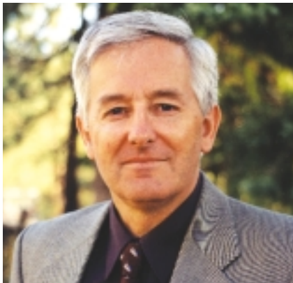
Chapman: 'I recommend that producers use an effective chemical drug to help clean up any Eimeria still present in the house.'

“Summertime, and the livin’ is easy.” So goes the song from a Broadway musical. Coincidentally, that line sums up perfectly the seasonal significance of a major poultry protozoan disease.