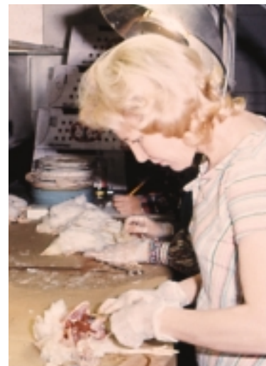
Johnson examining a chicken intestine and scoring the coccidial lesions.